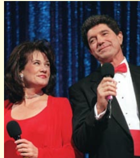
The Lawrence Welk Show