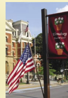
Our Town series