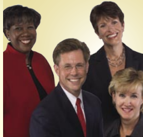
The cast of Pennsylvania Inside Out